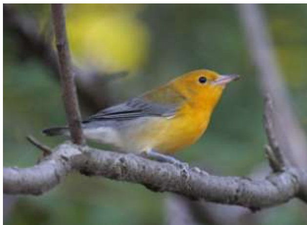
Prothonotary Warbler, a vagrant from the south.

1 The tour begins in Boothbay Harbor, an easy ride from the Portland Airport. You may be able to ride from Portland with Bob, or meet us at the dock. The Balmy Days Cruise Line will provide our transportation to our island destination. During the 70-minute crossing we'll look for pelagic species that may include Northern Gannet , Black Guillemot , rafts of Common Eiders , and possibly a Bald Eagle , Parasitic Jaeger , or Greater Shearwater . We should also see Harbor Seals and Harbor Porpoises , and maybe a whale or two. One year a Cape May Warbler joined us during the crossing. All four nights will be in quaint, comfortable lodging on Monhegan Island.